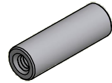
ISO SCALE 3 : 1