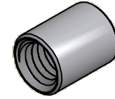
ISO SCALE 2 : 1