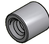
ISO SCALE 3 : 1