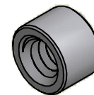
ISO SCALE 3 : 1