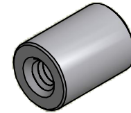
ISO SCALE 3 : 1