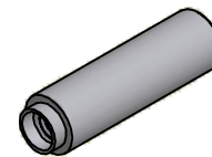
ISO SCALE 1 : 1