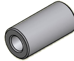
ISO SCALE 5 : 1