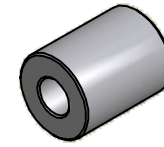
ISO SCALE 1 : 1