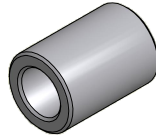
ISO SCALE 3 : 1