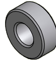
ISO SCALE 3 : 1