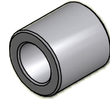
ISO SCALE 4 : 1