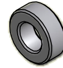
ISO SCALE 2 : 1