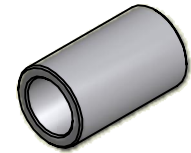
ISO SCALE 2 : 1