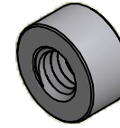
ISO SCALE 1 : 1