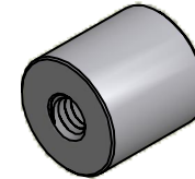
ISO SCALE 1 : 1