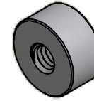
ISO SCALE 1 : 1