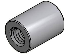
ISO SCALE 2 : 1