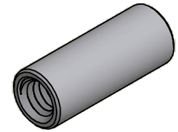
ISO SCALE 2 : 1