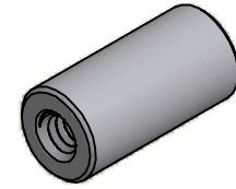
ISO SCALE 2 : 1