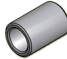
ISO SCALE 5 : 1