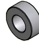
ISO SCALE 1 : 1