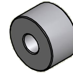
ISO SCALE 1 : 1