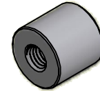
ISO SCALE 1 : 1