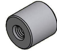
ISO SCALE 2 : 1