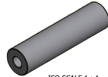
ISO SCALE 1 : 1