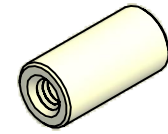
ISO SCALE 3 : 1