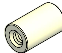
ISO SCALE 3 : 1