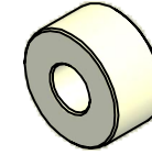
ISO SCALE 1 : 1