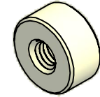
ISO SCALE 2 : 1