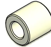
ISO SCALE 2 : 1