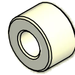
ISO SCALE 2 : 1