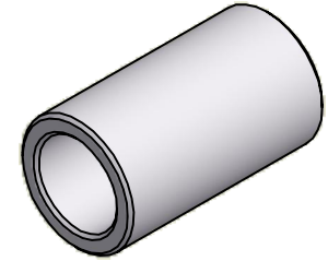
ISO SCALE 4 : 1