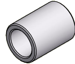
ISO SCALE 4 : 1