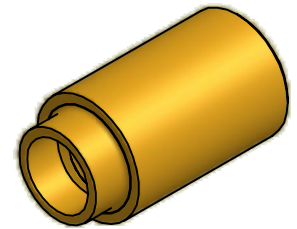
ISO SCALE 3 : 1