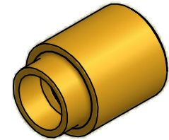
ISO SCALE 3 : 1