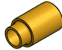
ISO SCALE 3 : 1