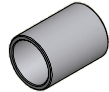
ISO SCALE 1 : 1