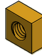
ISO SCALE 1 : 1