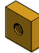
ISO SCALE 1 : 1