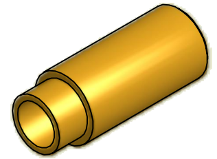
ISO SCALE 4 : 1