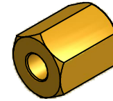
ISO SCALE 1 : 1