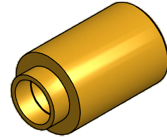
ISO SCALE 3 : 1