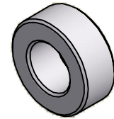
ISO SCALE 2 : 1