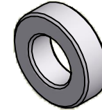
ISO SCALE 2 : 1