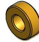
ISO SCALE 2 : 1