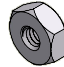
ISO SCALE 1 : 1