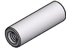
ISO SCALE 3 : 1