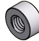
ISO SCALE 1 : 1