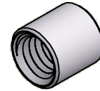
ISO SCALE 2 : 1