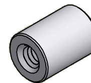
ISO SCALE 3 : 1